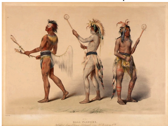
Figure 1. Ball Players. George Catlin. Date unknown.

American Indians are thought to have founded the modern game of lacrosse, as well as other stick games. Lacrosse, which received its name from French settlers, was more than a form of recreation. It was a cultural event used to settle disputes between tribes.